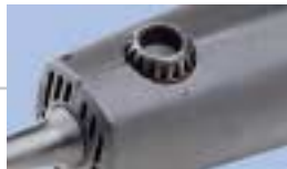
Speed controller for precise adjustment of the rotation of the saw blades