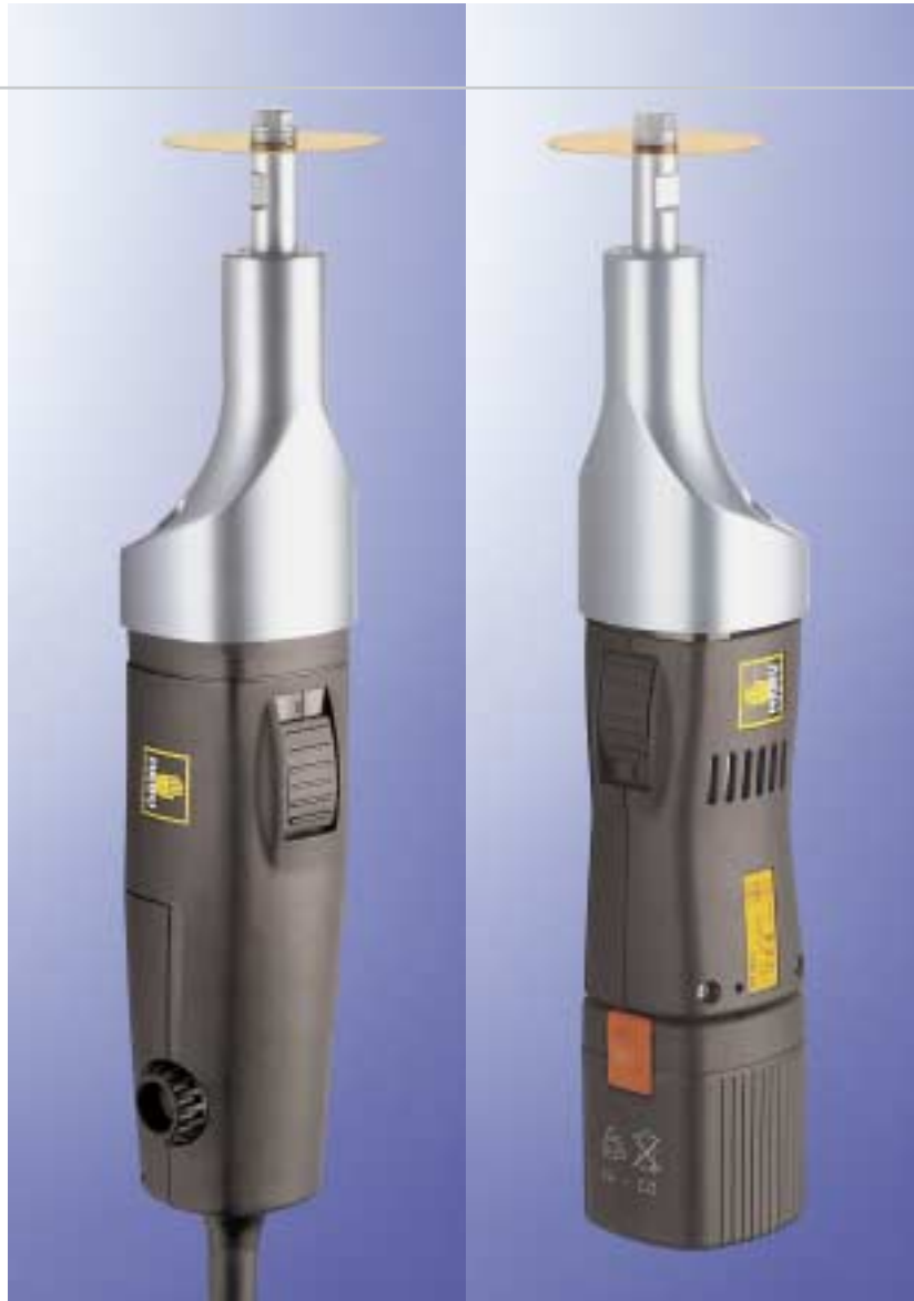
HB 8884 TITANIUM Plus (230V)

A new Oscillating Saw was developed with the TITANIUM Plus, which is specially designed for hard usage in orthopedic workshops. Due to its extravagant bearing, a combination of ball and needle bearings, it is appropriate for continual usage. The infinitely variable speed control in a range of 12000 - 21000 R/min. allows the rotations of the saw blades to be set to the respective requirements. Motor cooling occurs due to a circulation principle. Cool air is taken in at the end of the motor. Therefore the drive assembly is optimally protected from saw dust and soiling. The TITANIUM Plus comes with the specially robust new Round Saw Blades HB 8895-03 (TITANIUM) Ø 50 mm and HB 8896-03 (TITANIUM) Ø 65 mm.