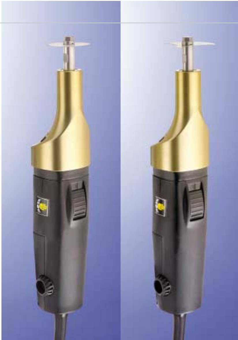
HB 8894 GOLD Plus (230V)

The GOLD Plus comes with a Round Saw Blade HB 8895-02 (Ø 50 mm) and HB 8896-02 (Ø 65 mm) for synthetic dressings.