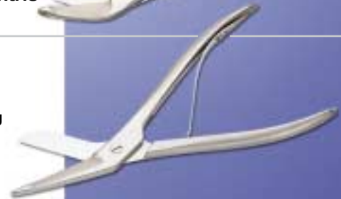
HB 1990C 23 cm Seutin Cast Cutter