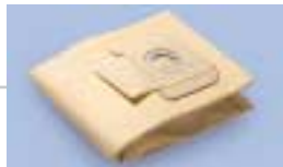
Paper Filter Bags as a helpful accessory