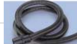
Flexible and robust tube with bayonet connector