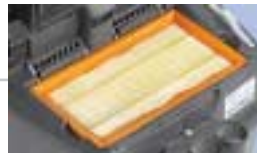
Eco-Flat Folding Filter for Wet and Dry vacuuming