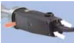
Motor cooling due to a circulation principle