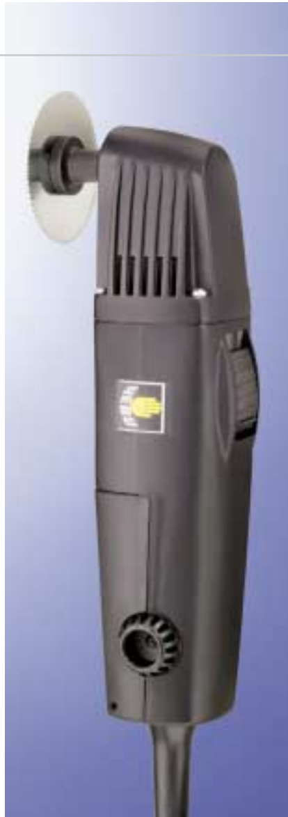
HB 8880 ECO Plus (230V)

Plaster cast and hard plastic dressings are no problem for this one hand Oscillating Saw. It allows for exact and safe cutting. Its ergonomic form and compact construction make it easy to handle. Due to the turning knob of the electrical speed control, the rotations of the saw blade can be easily adjusted to the respective requirements. The ECO Plus comes with a Round Saw Blade HB 8896-01 (Ø 65 mm) for plaster casts and with a Round Saw Blade HB 8896-02 (Ø 65 mm) for synthetic dressings.