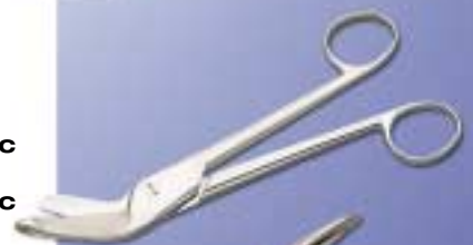
HB 1990 23 cm Seutin Cast Cutting Scissors