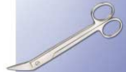
HB 1989-16 Excentric 16 cm HB 1989-19 Excentric 19 cm HB 1989-16C Excentric Cast Cutter 16 cm HB 1989-19C Excentric Cast Cutter 19 cm