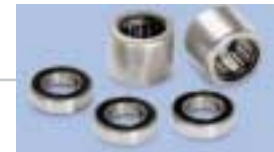
High quality needle and ball bearings for precise functioning