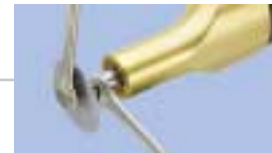
Saw Blades can be easily changed