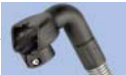
Dust Removal Unit

For Upgrading: Vacuum Cleaner + Tube + Dust Removal Unit + Tools