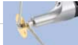
Saw Blades can be easily changed