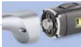
Perfect and reliable drive assembly technique