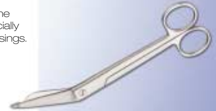
HB 1992C 18cm Cast Cutter