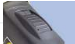
Ergonomic On/Off Switch