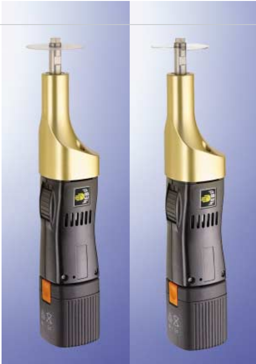
HB 8874 GOLD Accu (230V)

The GOLD Accu comes with a charger as well as a Round Saw Blade HB 8895-02 (Ø 50 mm) and a Round Saw Blade HB 8896-02 (Ø 65 mm) for synthetic dressings.